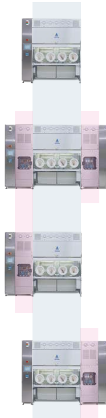
High flexibility of modular isolators and airlocks