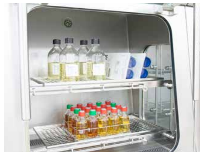
Safe and rapid transfer airlock (SARA)